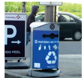
Montréal, Sud-Ouest borough