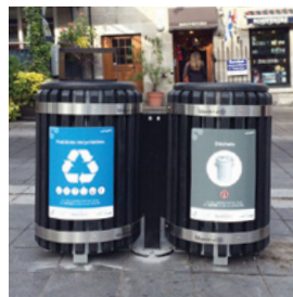
Montréal, Ville-Marie borough